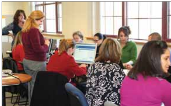
Wheeler Clinic staff members participated in intensive trainings to learn the new electronic health record system.

Hartford Foundation for Public Giving has awarded Wheeler Clinic a $195,000 grant to support implementation of an electronic health records system. The state-of-the-art system will improve the continuity of care the clinic provides to its clients through detailed, real-time information.