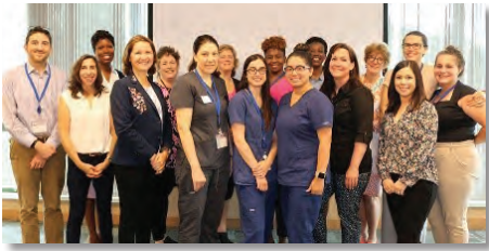
Leaders from HealthySteps and members of Wheeler's integrated health care team.

A secure parent-child bond is critical to a child's development because it fosters a sense of security, self-esteem, and resilience and is an essential building block for forming strong relationships in life.