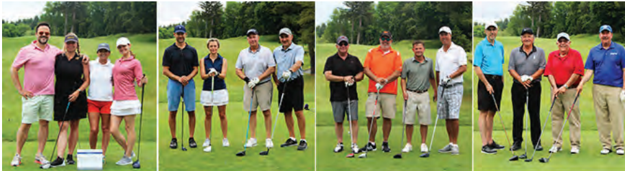
Title Sponsor Mutual of America

More photos available at WheelerClinic.org/golfclassic .