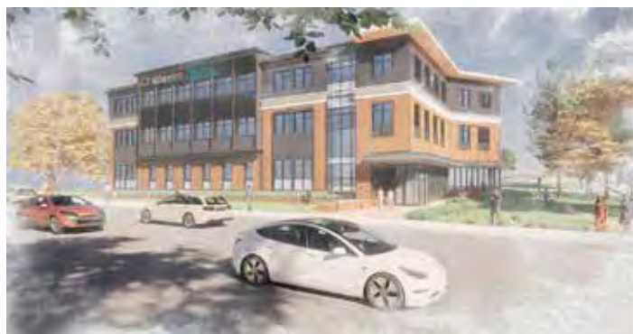
The image above is a rendering of the proposed new building.

Today, in addition to community health centers at 10 and 225 North Main streets, Wheeler operates community justice and intervention programs, as well as Child First, an intensive, home-visiting model for young children and their families, and school-based health centers in every Bristol Public School.